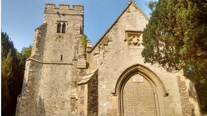
The ruins of St Mary's church stand close to the trail, in Eastwell Park. In the churchyard, there is a Victorian tomb, which is reputed to be the grave of Richard Plantagenet, an illegitimate son of Richard III.

7. Continue straight on road, as it turns to left walk straight passing through gate into field. Walk with fence on your right, after 400 metres turn left and cross field. Cross the driveway and take footpath behind Eastwell Manor Sign. Pass through gate and across the field to second gate leading to road.