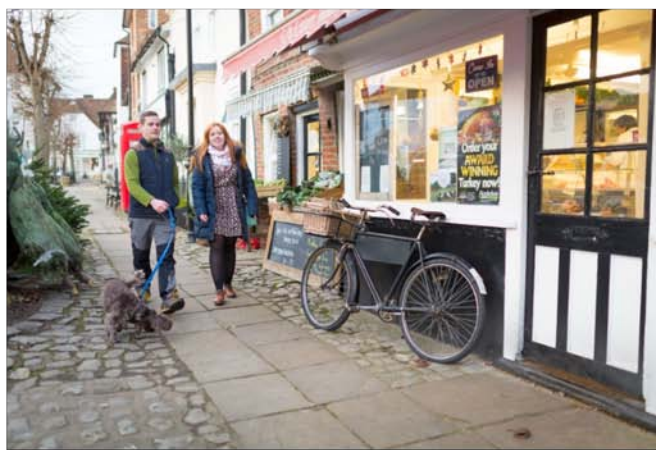
Lenham Village © Explore Kent

1. With the Pilgrims Way signpost on your left walk straight on the concrete road. Pass over a horse friendly car barrier gate and continue on the gravel path. Look out for the Chalk Memorial Cross on your left. Continue straight through woods to second gate and road.