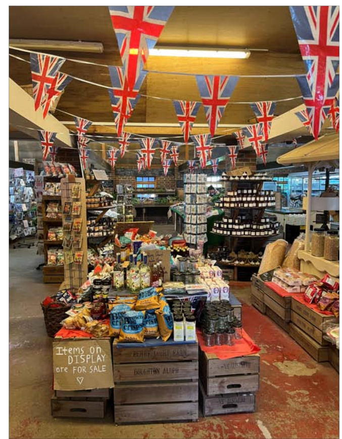
Perry Court Farm Shop

This traditional fruit growing farm was established in the 1940s and now grows over 150 varieties of apple with the fruit going to over 40 markets a week. Sample the apple juice or locally made cakes at the farmshop and tearoom which was created in 1965.