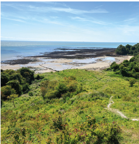
East Cliff and Warren Country Park.

At the top, walk along the cliff edge to your right. Admire the Battle of Britain War Memorial 5 , the National Memorial to the 'Few'. There is an amazing aircraft museum, wall of remembrance, café and facilities.