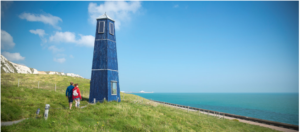
Spectacular views of Saphire Hoe can be seen from the cliff tops.

The walk along the cliff edge gets very narrow. You may prefer to take a small diversion by walking east along Old Dover Road, just inland of the War Memorial. Continue on Dover Road until it meets New Dover Road. At the V junction, walk east along New Dover Road for 50 metres. Then look for the waymarked path on your right between bushes. Take this path to the cliff top, then turn left for spectacular views from Abbot's Cliff 6 .