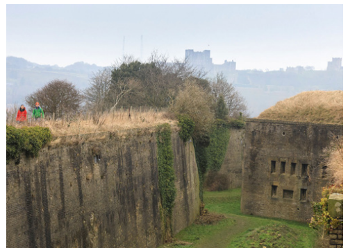
Drop Redoubt, Dover's upside down castle.

Take the path down to the town centre square and be sure to visit Dover Museum 10 and Bronze Age Boat Exhibition. Take your time to explore Dover, it's known as the Gateway to England and welcomes millions of visitors from all over the globe every year.