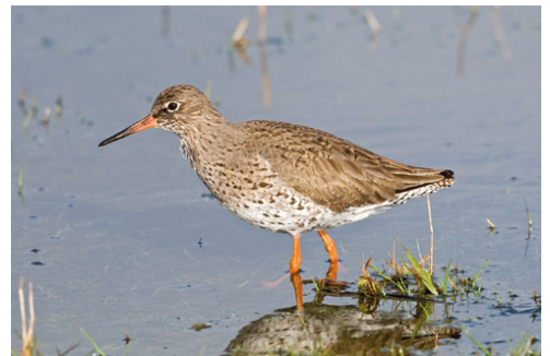
Redshanks can be seen at Oare Marshes.

The path becomes a gravelled path as you continue onwards. The Swale will be on your right, a tidal channel between the mainland and the Isle of Sheppey. Here you have fantastic views across the Isle of Harty.