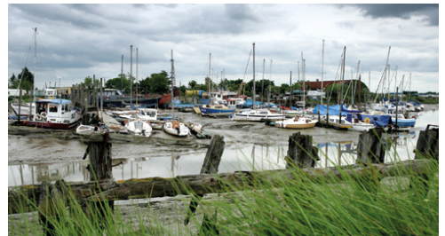
Boats moored up in the creek.

At the kissing gate at the end of this field turn right and walk down The Street into Oare. Continue past The Three Mariners pub ⑤ towards the Castle Inn to return to where you began.