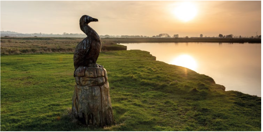
Views across Barton's Point Coastal Park.

last house in the cul-de-sac. Continue down the path to the left-hand side of the house. The path immediately turns to the left.