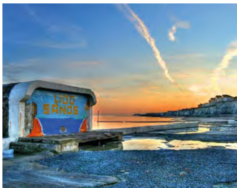
Sunset at Margate Lido.

promenade. Then cycle over the clifftops, on a clear day the views from here are amazing with the village of Grenham sitting on top of the chalk cliffs. Grenham Bay is below you. Look out to sea and see the Kentish flats wind farm off Herne Bay and ships anchored in Margate.