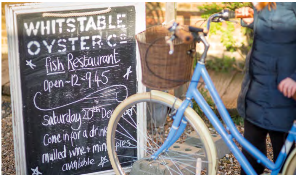
Enjoy a taste of the sea in Whitstable.

Haven Drive. Then left onto Manor Road. At the end of this street continue straight following the path off-road again and into the woods. Continue on this path through the woods, turn right and right again and continue ahead towards a car park. Then drop back down to re-join the sea wall and the Saxon Shore Way.