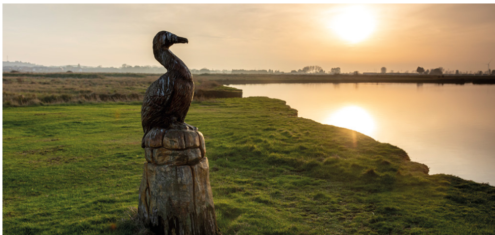
Views across Barton's Point Coastal Park.

last house in the cul-de-sac. Continue down the path to the left-hand side of the house. The path immediately turns to the left.