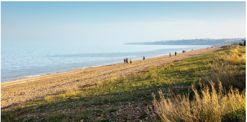
The endless shingle of Sheerness Beach.

At the end of the off-road path, exit left onto New Road. At the junction ahead turn right onto Queens Way, follow the blue cycle signs for Queenborough Lines Route 174. Take a right into Linden Drive, follow the road until the very