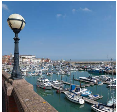
Ramsgate Royal Harbour is the only Royal Harbour in the UK.

Your walk finishes at Ramsgate Obelisk, it's at the far end of the harbour on Harbour Parade. Close by you will find toilets, cafés, the Ramsgate Tunnels and the Ramsgate Maritime Museum.