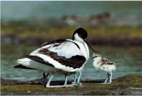
The Sandwich Flats are home to many species of birds.