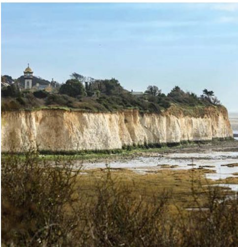
The tower of Pegwell Bay Hotel.

Listen for the sound of nightingales and cuckoos in late spring/early summer as well as many warbler species, all creating a wall of sound to delight the ears. In autumn there is an influx of waders and waterfowl feeding on the saltmarsh. If you are lucky you might spy seals at the Stour River Estuary.