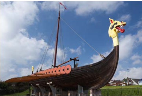
The Hugin is a reconstructed Viking longship.

Take the Coast Path which is clearly signed towards Ramsgate.