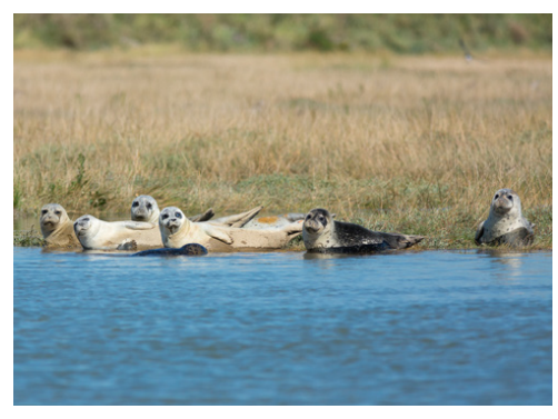
During your walk, you may spot seals basking.