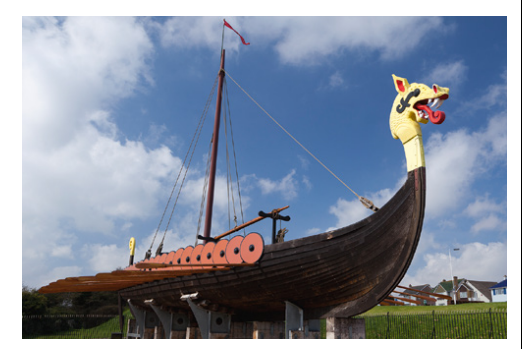
The Hugin is a reconstructed Viking longship.

Take the King Charles England Coast Path (KCIIIECP) which is clearly signed towards Ramsgate.