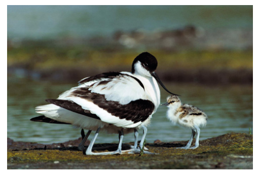
The Sandwich Flats are home to many species of birds.