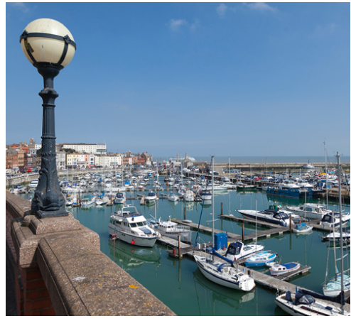
Ramsgate Royal Harbour is the only Royal Harbour in the UK.

Your walk finishes at Ramsgate Obelisk, it's at the far end of the harbour on Harbour Parade. Close by you will find toilets, cafés, the Ramsgate Tunnels and the Ramsgate Maritime Museum.