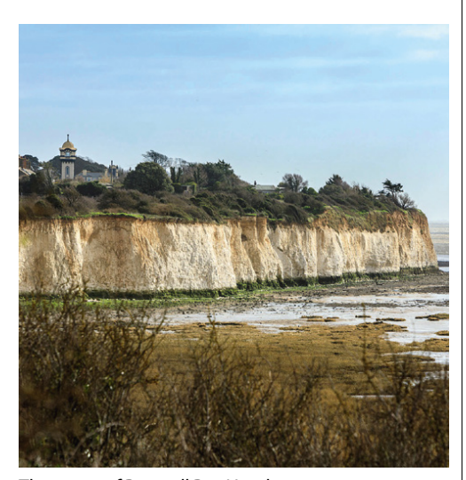
The tower of Pegwell Bay Hotel.

PUBLIC TRANSPORT: Bus services run from Ramsgate bus station. Check <u>kentconnected.org</u> for times and services.