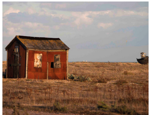
A long abandoned fishing hut sits on the shingle at Dungeness.