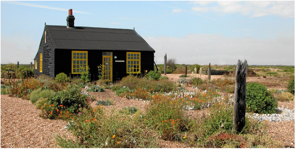
Prospect Cottage: former home of film-maker Derek Jarman.

see the Dungeness National Nature Reserve 4 , home to bird species including bittern, little ringed plover and Slavonian grebe to name but a few.