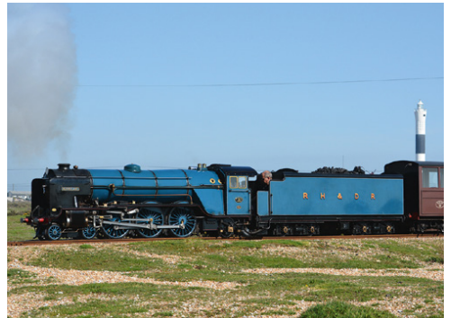
The Romney, Hythe and Dymchurch Railway.