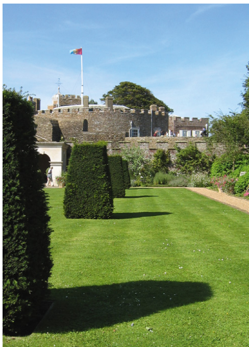
Eight acres of award-winning gardens await at Walmer Castle.

Go down to the bay 6 and pick out the white house with green shutters. This was the James Bond author Ian Fleming's former holiday home, White Cliffs, which he bought in 1952 from his friend, Noel Coward.