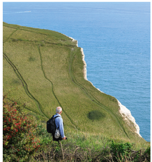
Langdon Bay Cliffs offer an excellent viewpoint.

On the far side of the lighthouse turn left down a short path which leads into a lane, turn right along the lane, walk approximately 20 metres and take the gate on your right, into a field. Follow the cliff path to its end and turn left into another lane which leads to the lovely village of St Margaret's-at-Cliffe. Where the path enters the village, you will find the Pines Garden, Tearoom and Museum ❺.