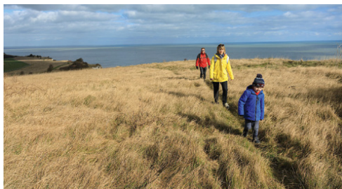
The cliff tops at St Margaret's-at-Cliffe offer beautiful views.

The walk ends at Deal Pier 12 , which is clearly visible to the right. The pier is the same length as the Titanic and at the end there is a wonderful café with incredible Channel views and a very well-earned cuppa. Be sure to visit The History Project which offers historic walking tours of Deal on Saturdays and Sundays throughout the summer from their yellow tent on Deal seafront, across from Deal Beach Parlour. Tours cover all aspects of the town's history from Caesar's invasions to the modern day.