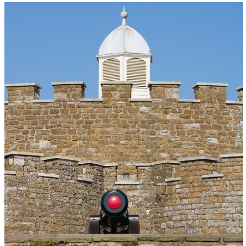
Deal Castle, built by order of King Henry VIII.

Leaving Deal, you will see the remains of Sandown Castle ②. Henry VIII's third castle was built between 1539/40. Sadly, it was claimed by the sea in the 1800s and the stones were later reclaimed