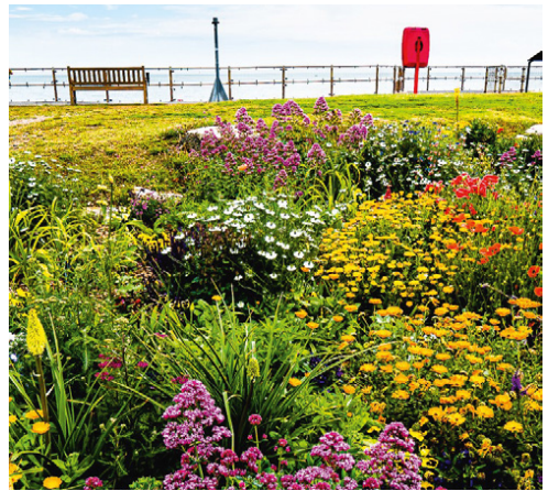
Sandown Castle community garden.

The Great Stour meanders its way peacefully through Sandwich.