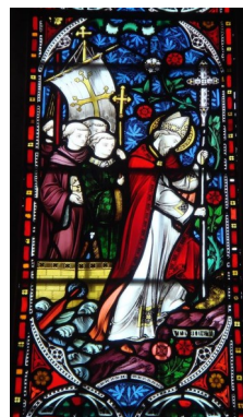
St Augustine landing in Thanet, from Pugin's Shrine of St Augustine

The new "Way of St Augustine" is designed to be walked between the Shrine of St Augustine in Ramsgate, and the historic pilgrim city of Canterbury. It is approximately 19 miles long, and can be done in a day, but is probably better split in two, with an overnight stop half way, perhaps trying out "champing"!