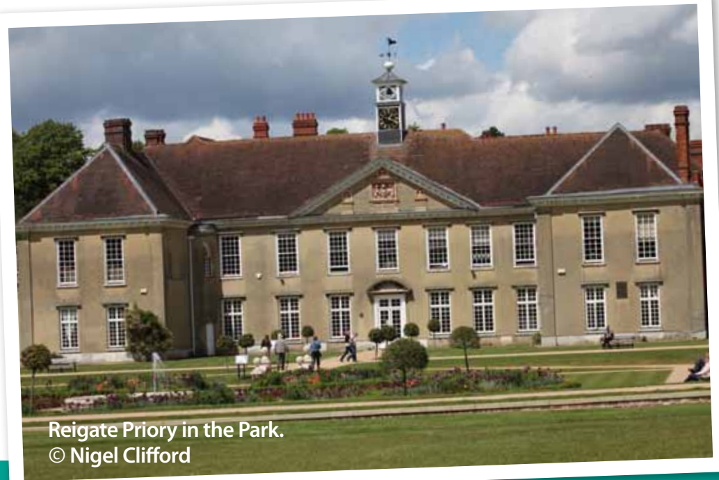
Reigate Priory in the Park.

Go ahead, with the hedge on your left, to a metal kissing gate. Continue ahead, with first a hedge and then a fence on your right, to