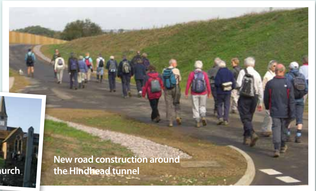
New road construction around the Hindhead tunnel

In the churchyard you will find the stone erected in memory of the sailor murdered on Gibbet Hill. Eight chest tombs recall local 18th century residents, more prosperous in their day