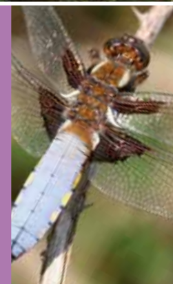
Photo credits cover: Foxglove (Andy Vidler www.andyvidler.co.uk). Woodland, Broad-bodied Chaser, Oast House (Steve Songhurst)