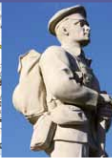
War Memorial