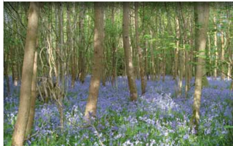
Bluebells (Steve Songhurst)

Print managed by County Print & Design 01622 60368 20560/BS