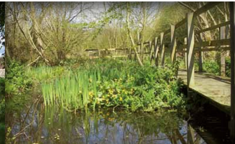
Twyford Bridge, Yalding (MVCP)