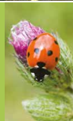
Photo credits cover: Pond at Yalding Fen (Medway Valley Countryside Partnership – MVCP) Ladybird, Dragonfly and Teasel (Andy Vidler www.andyvidler.co.uk)