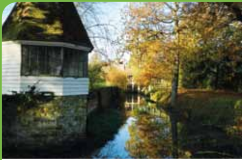
The moat at Sissinghurst Castle