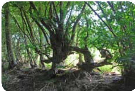
Field boundary hedge

Note the hornbeam-topped field boundary on your right, which shows signs of hedge laying in the past, where there are old horizontal stems with vertical shoots rising from them.