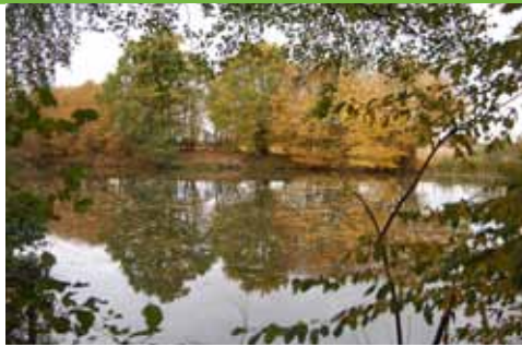
Lake Near Park Farm