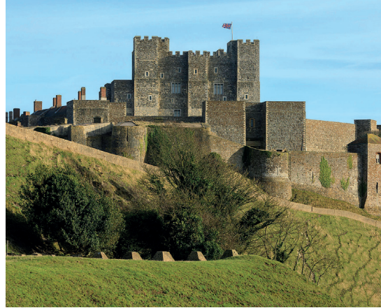
The Romans placed two lighthouses, known as pharos, to alert seafarers in the treacherous Dover Straits. One was built at nearby Dover Castle and a second on the Western Heights.