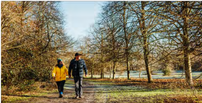
Couple walking on path between trees