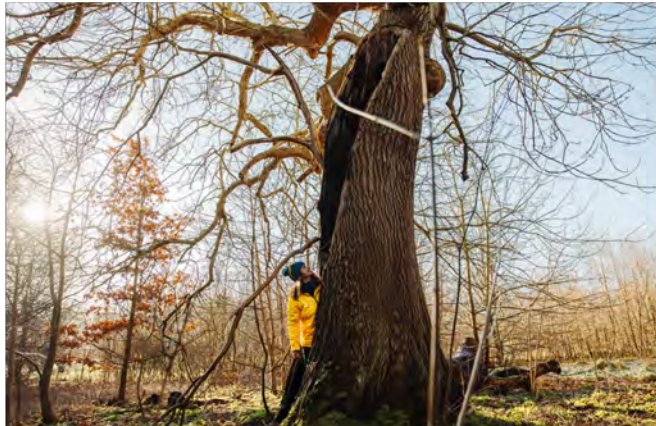
Women in yellow winter jacket admiring a large veteran tree

For more information about Camer Park please call 01474 337553