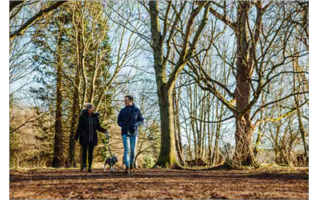
Man and woman walking a dog amidst winter trees